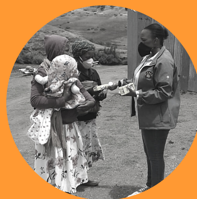
OUR WONDERFUL OUTREACH TEAM DELIVERING FOOD PACKAGES

The Outreach Team at TTL worked passionately in their drive to reach and serve the local community in Mokhotlong. Because of the many challenges this year, the nutritional and health support provided by the Outreach Team was more important than ever. Our Outreach Team provides wellness assessments for the children in our community, conducts home visits, and delivers food packages to our clients. This year, the team completed 699 home visits, brought 120 new children into our program, and graduated 59 children after they reached a consistent, healthy weight for their age. Our Outreach Team also distributed 2,206 Vitamin A tablets, which help prevent childhood blindness and reduce mortality from common childhood infections, and 1,822 Albendazole deworming tablets to treat intestinal worms, which can impede children's growth and development.