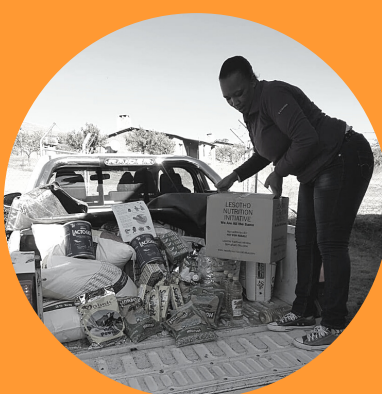
LOADING THE TTL TRUCK WITH FOOD TO DELIVER TO OUR CLIENTS