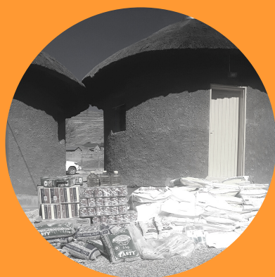
FOOD PARCELS AND SUPPLIES TO SUPPORT THE COMMUNITY

PROVIDING NUTRITIOUS MEALS TO ENSURE THE HEALTHY DEVELOPMENT OF LOCAL CHILDREN