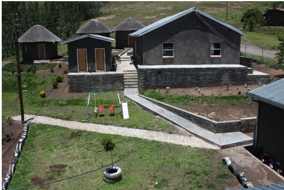
A bird's eye view of TTL's campus and the growth it sustained this year. The large building at the right of the photo is the new Hesburgh-Amicus Centre, housing new TTL offices. The photo was taken from the roof of the TTL Safe-home.

Once established, the two campuses will work together to create a broader, more far-reaching presence for TTL across two districts.