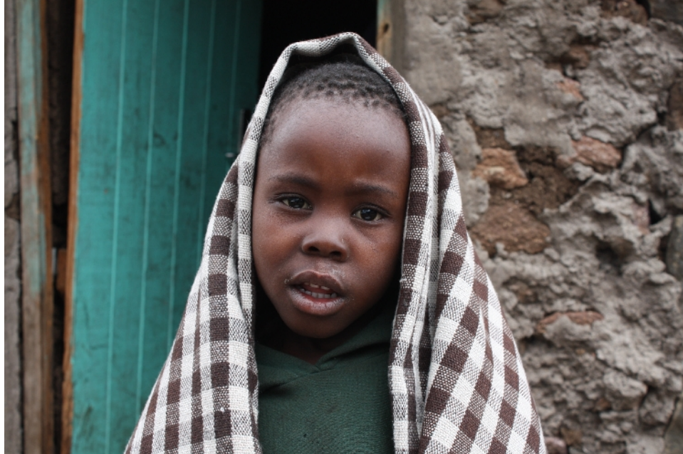
A young girl whose family benefited from TTL's support of her younger sister.

P.O. Box 72, Mokhotlong 500 Telefax: (+266) 2292 0454 Cell: (+266) 63 126 126 E-Mail: ttl@leo.co.ls