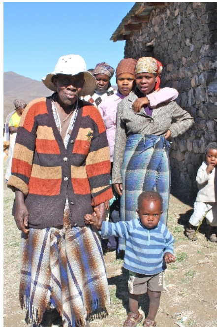
Some of the Village Health Workers who now serve as TTL's eyes and ears in their rural communities, assessing children for malnutrition and illness.

In the coming year, TTL hopes to further develop this network as it continues its expansion throughout the Thaba Tseka District.